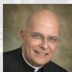
Francis Cardinal George, OMI, Archbishop of Chicago