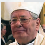
Abp. Pietro Sambi, Apostolic Nuncio to the United States of America