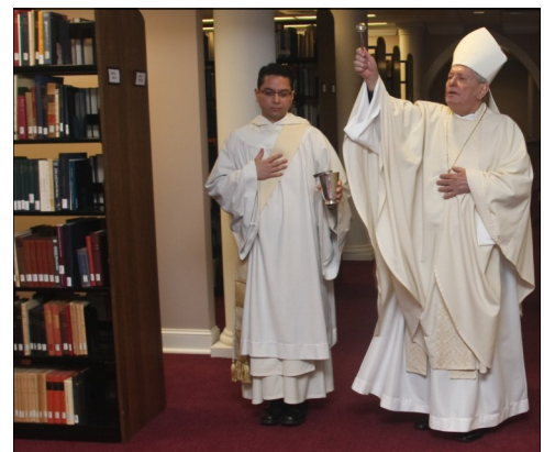
Archbishop Pietro Sambi blesses the new library