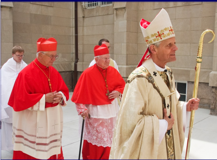
From left, Adam Cardinal Maida, William Cardinal Keeler, and Archbishop Donald Wuerl, during the dedication.