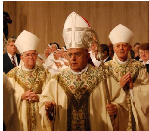
Newly ordained Archbishop DiNoia blesses the congregation

The Pontifical Faculty rejoiced this summer as it celebrated the episcopal ordination of Archbishop Joseph Augustine DiNoia, O.P., a former faculty member and president of the PFIC. Pope Benedict XVI appointed him as Secretary of the Congregation for Divine Worship and the Discipline of the Sacraments on June 16, 2009. On Saturday July 11 at the Basilica of the National Shrine of the Immaculate Conception, Fr. DiNoia was ordained the titular Archbishop of Oregon City by William Joseph Cardinal Levada, Prefect of the Congregation for the Doctrine of the Faith, as the principal consecrator, with Archbishop Donald Wuerl of Washington and Archbishop Emeritus Thomas Kelly, O.P. of Louisville as co-consecrators.